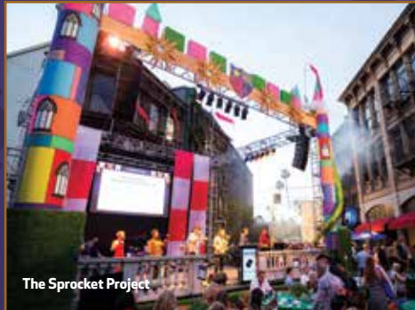
The Sprocket Project