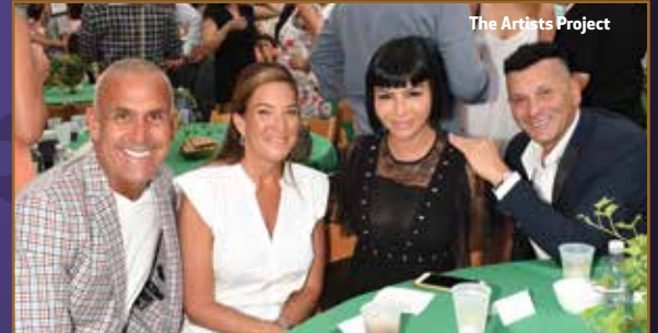
The Artists Project