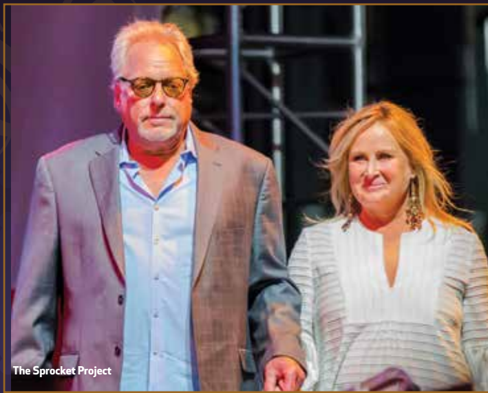
The Sprocket Project