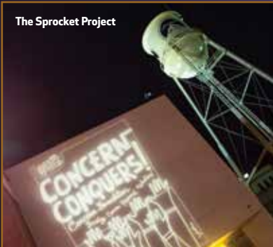
The Sprocket Project