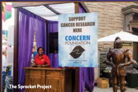
The Sprocket Project