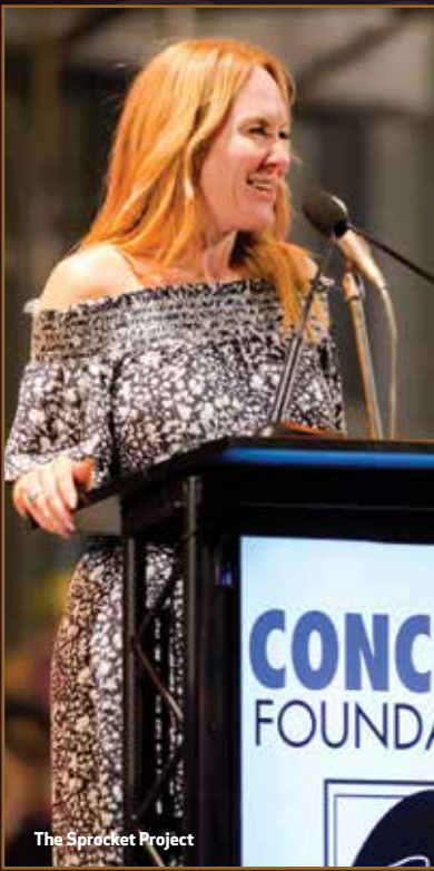
The Sprocket Project