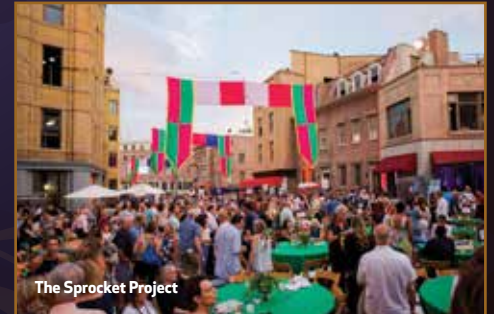
The Sprocket Project