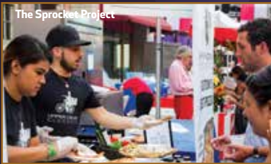
The Sprocket Project