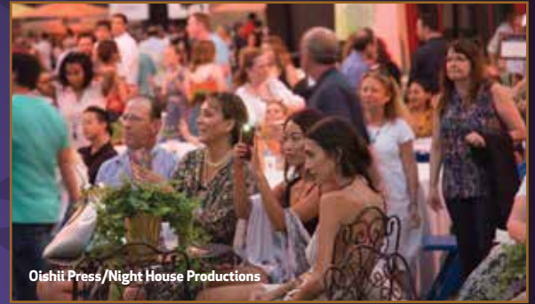
Oishii Press/Night House Productions