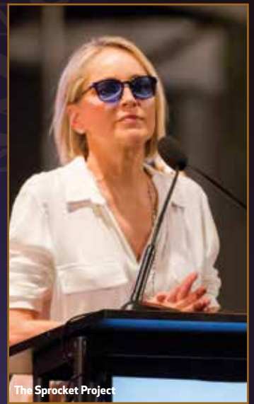
The Sprocket Project