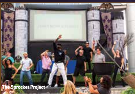
The Sprocket Project