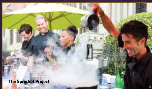
The Sprocket Project